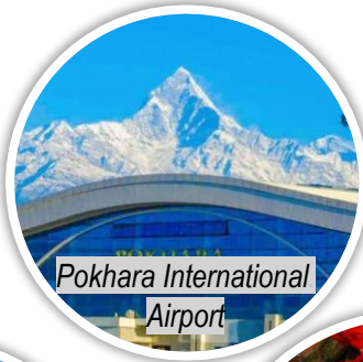
Pokhara International Airport