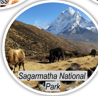
Sagarmatha National Park