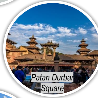
Patan Durbar Square