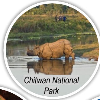
Chitwan National Park